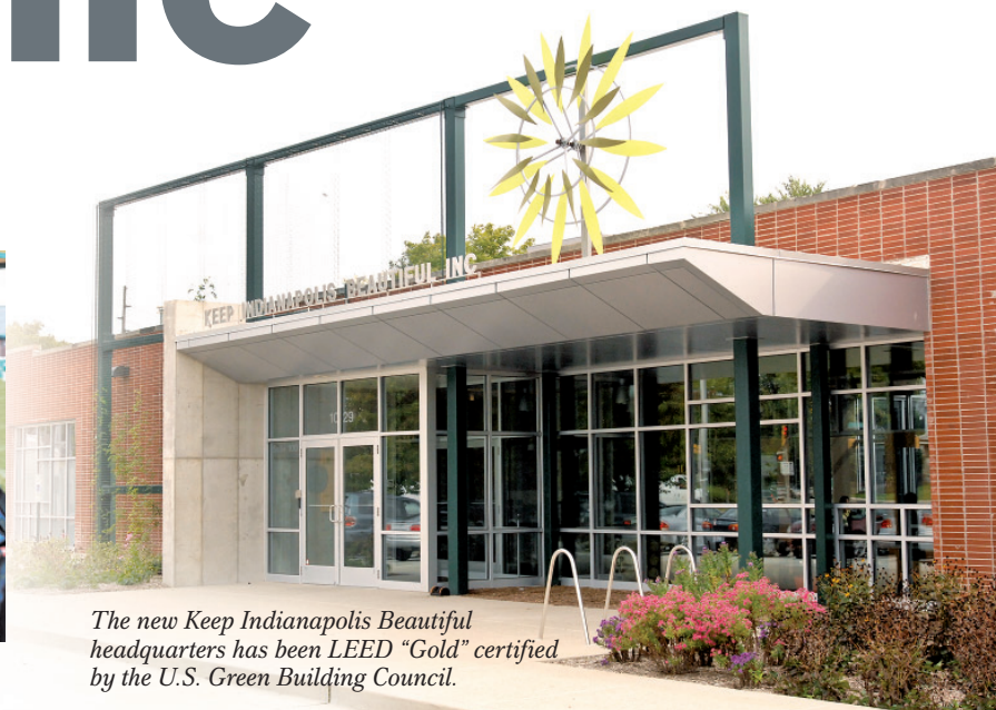
The new Keep Indianapolis Beautiful headquarters has been LEED "Gold" certified by the U.S. Green Building Council.