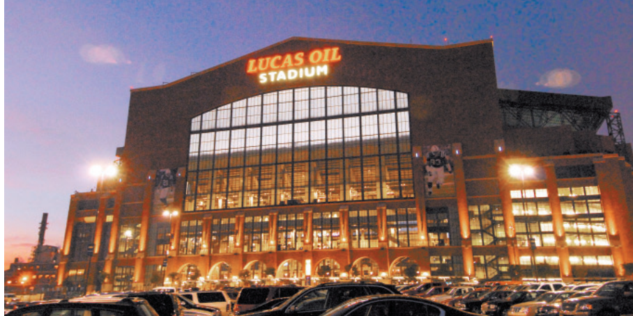
Lucas Oil Stadium is home to the NFL Indianapolis Colts football team and numerous concerts and sporting events throughout the year.