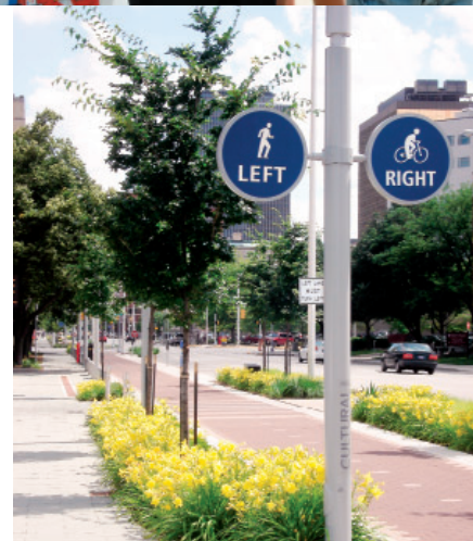
The $50 million Cultural Trail links cultural districts throughout Indianapolis.

The performing arts in central Indiana will get a boost in 2010 with the opening of the $150 million Center for the Performing Arts currently under construction in the Carmel City Center. It will include three state-of-the-art performing arts venues: a 1,600-seat concert hall called the Palladium, a 500-seat proscenium theater and a 200-seat studio theater. The venues will be situated around a landscaped mall featuring retail shops, restaurants, office space, luxury condominiums and an outdoor amphitheater.