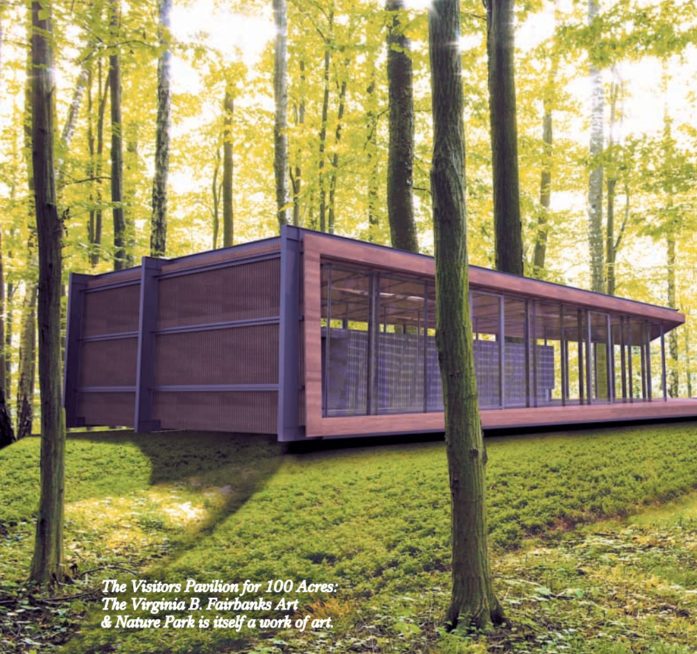
The Visitors Pavilion for 100 Acres: The Virginia B. Fairbanks Art & Nature Park is itself a work of art.

S uccessful companies depend on creative, innovative employees. Attracting these workers takes more than a nice paycheck because they are looking for much more.