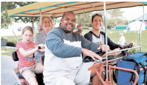
Families enjoy activities at White River State Park year-round.

Culturally Rich, Vibrant and Green – A Region Designed to Attract the Creative Class