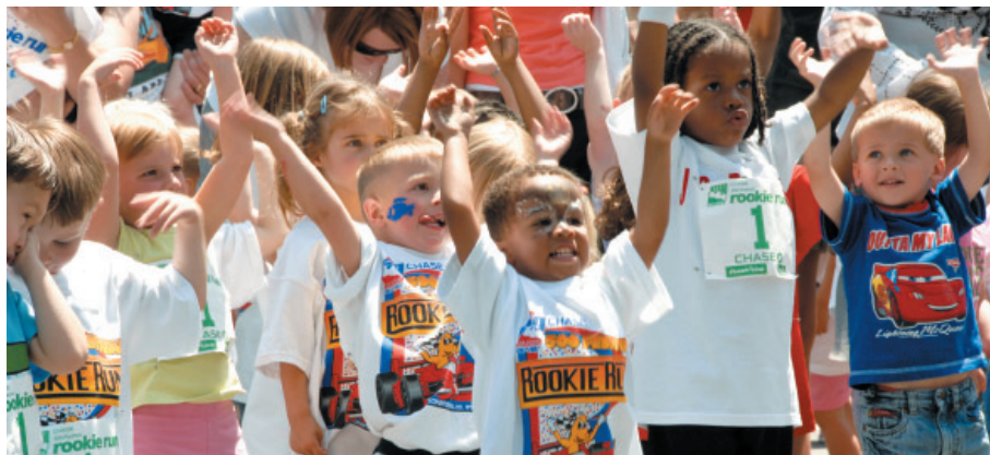
Children prepare for the annual "Rookie Run," part of the regional festivities connected to the Indianapolis 500 Mile race.