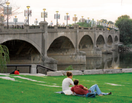
"The Lawn" at White River State Park hosts family picnics and internationally-known recording artists' performances.